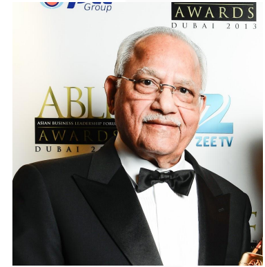
DR PRATHAP REDDY Chairman, Apollo Hospitals, India Recipient, ABLF Lifetime Achievement Award 2013

"The ABLF is a very significant initiative of IEDEA, which shines a light on the healthcare sector in Asia, that is of great importance to India and the UAE"