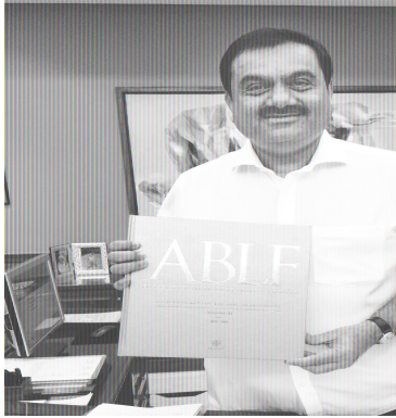
GAUTAM ADANI Chairman, Adani Group, India

"We are committed to the potential of Asia, investing the West Asian region and leveraging the India-UAE relationship, hence our endorsement for the ABLF initiative of IEDEA"